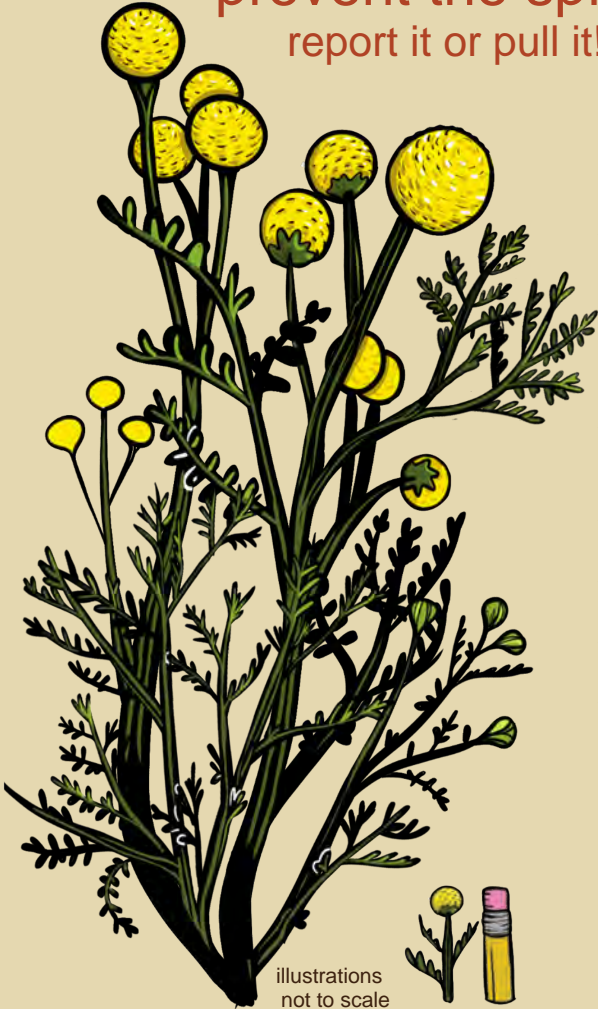
illustrations not to scale

prevent the spread report it or pull it!