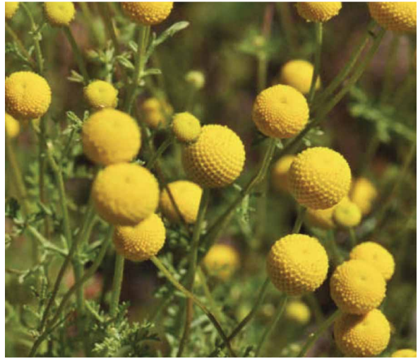
Stinknet blossoms are round and bright yellow.