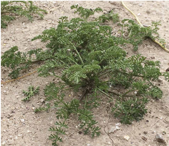
Stinknet leaves have a pungent smell.